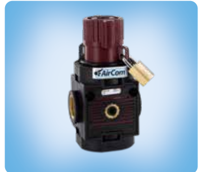
V0 manual switch-on valve