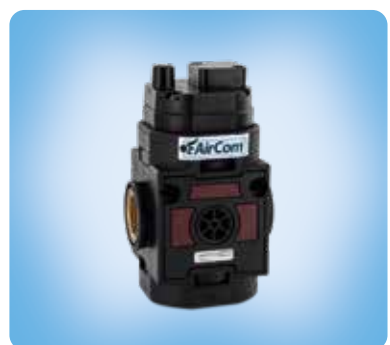
A0 soft start valve